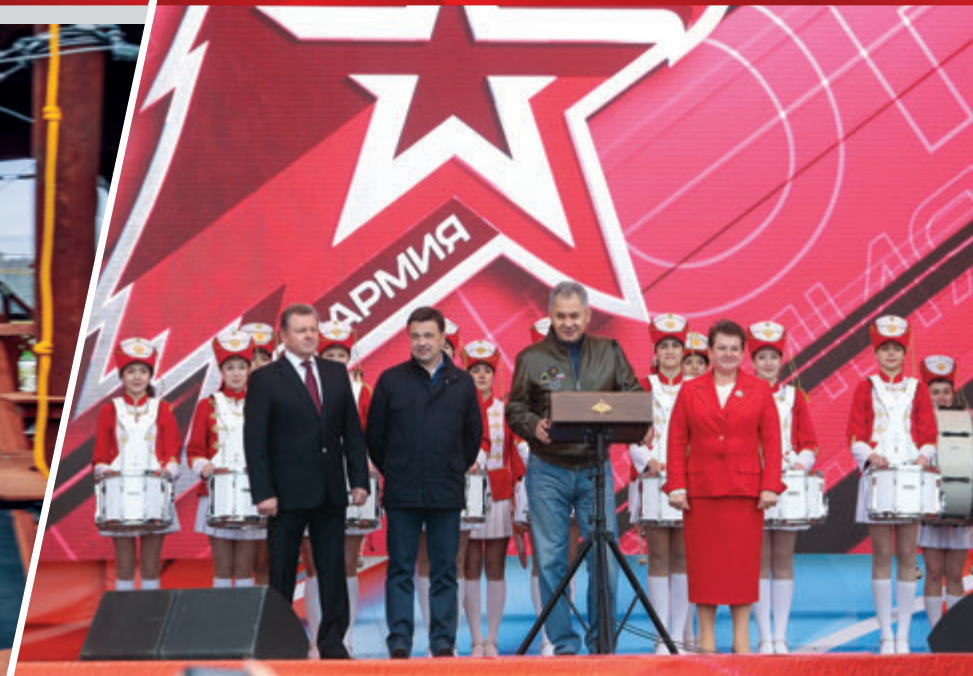
YOUNG ARMY (YUNARMY) SECTOR