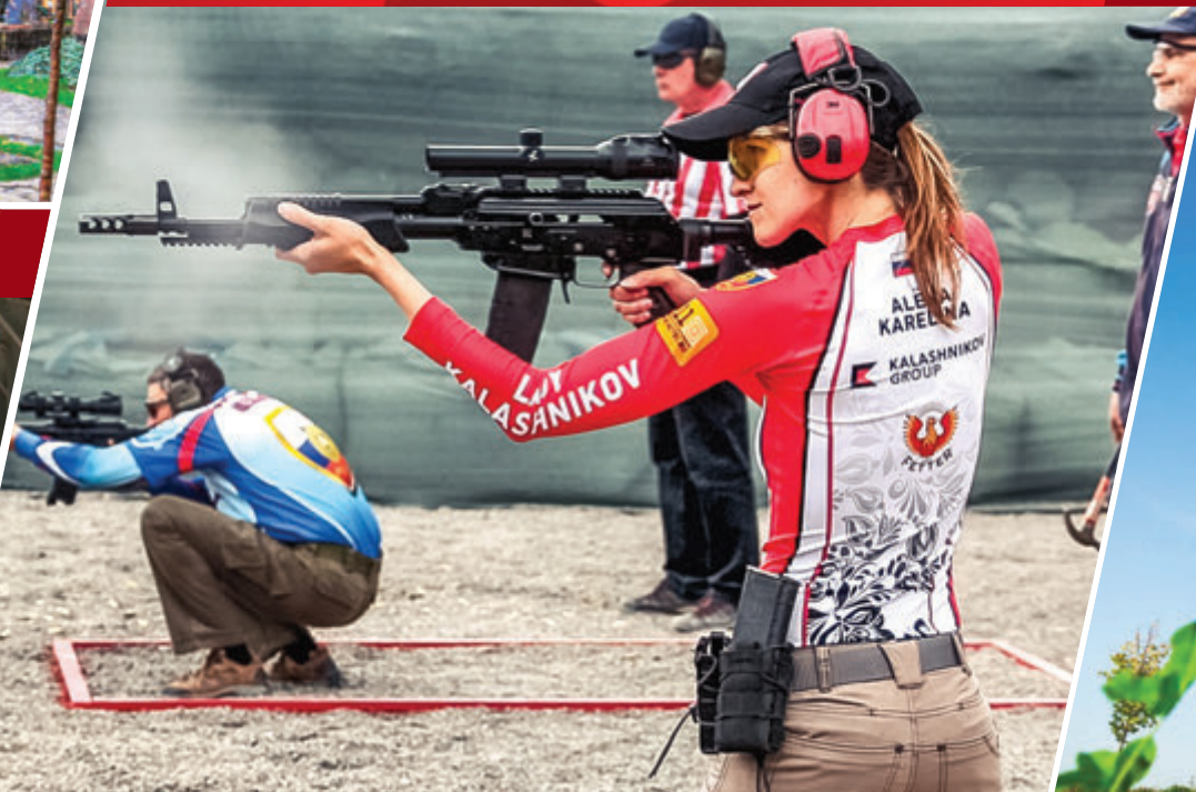
MULTIFUNCTIONAL SHOOTING CENTRE