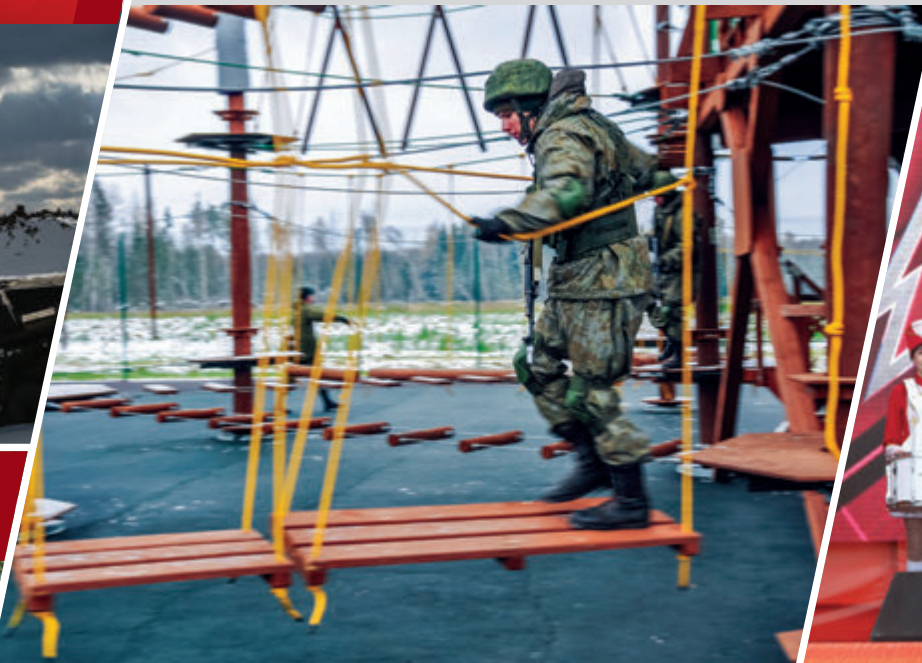
CENTER FOR MILITARY AND TACTICAL GAMES